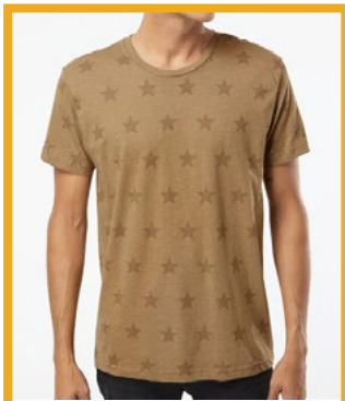
LAT Code Five Star Print Tee