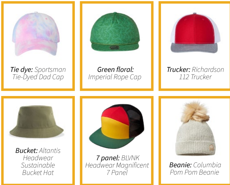
Tie dye: Sportsman Tie-Dyed Dad Cap

Some popular headwear styles to consider: