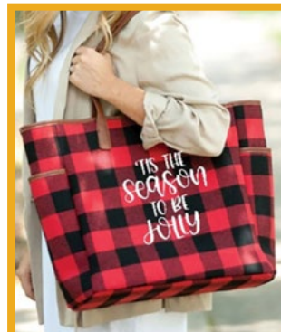
Viv&Lou Red Buffalo Check Hayden Tote