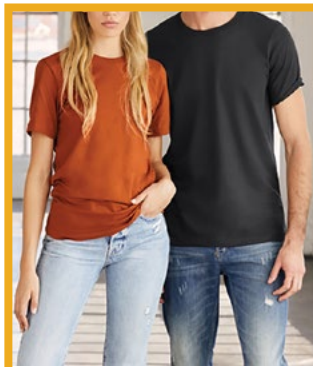
Bella+Canvas Jersey Tee