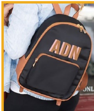
Viv&Lou Black Lauren Backpack

The purse and handbag market continues to grow at a steady pace and will only continue to increase in market size over time. As a custom printer, tapping into this market is simple with the right heat print technology.