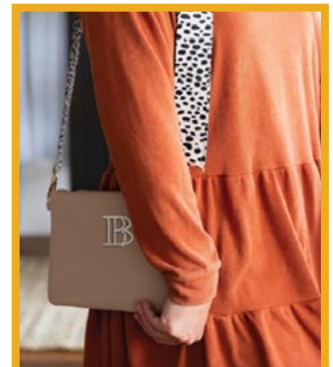
Viv&Lou Crossbody Strap & Hadley Purse