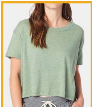
Alternative Vintage Jersey Crop Tee

Some popular T-shirt styles to consider.