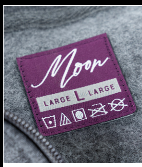
TAGS (Must Be Sewn)