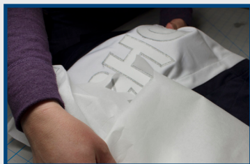
FOR BEST RESULTS: remove sewing stabilizer after heat application.