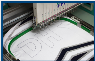
SEW Placement Stitch.