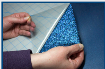
CUT a section of heat transfer material slightly larger than your design. Remove carrier if using a CAD-CUT® material.