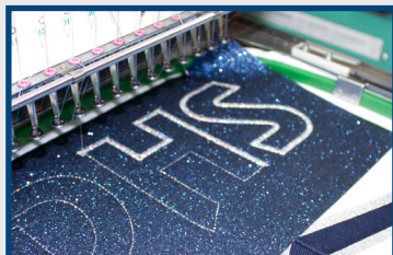
SEW Satin Stitch. Machine Speed: 500 – 700