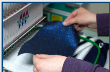
POSITION material over placement stitch.