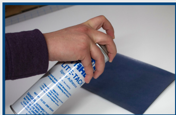
LIGHTLY COAT back side of material with spray adhesive.