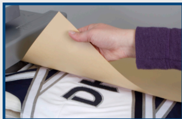
HEAT APPLY material with a Cover Sheet over the design and a Heat Printing Pillow inside the garment.